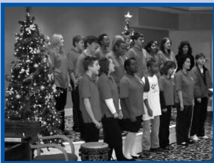
TLC's Katherine Thomas School Chorus gave it first performance in