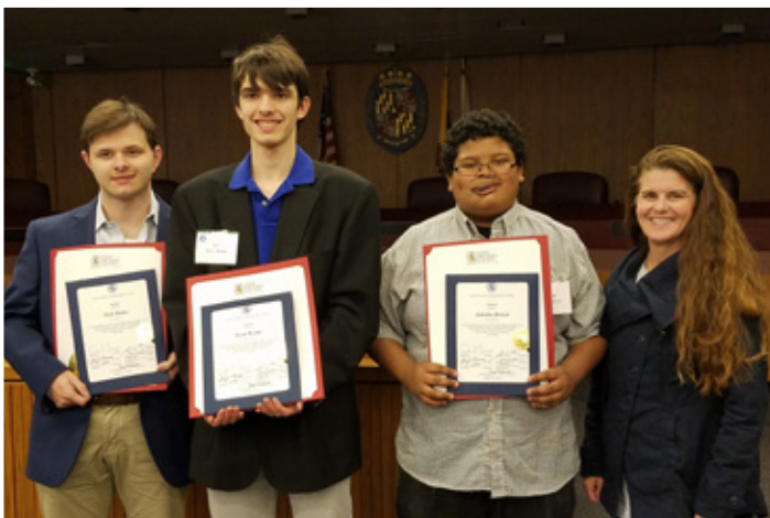
Artists Without Limits