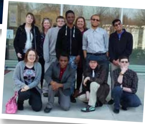
Schools in Court