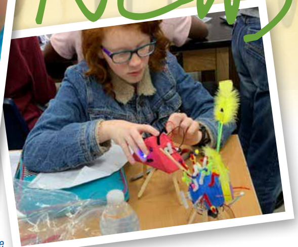
Artists in residence