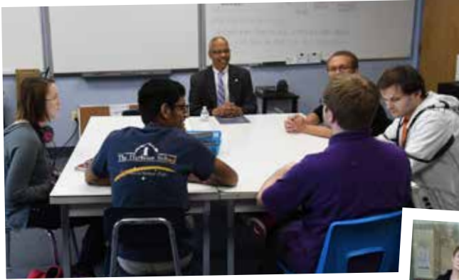
Q & A With students

Visit from the Lt. Governor - On April 30, 2019, Lt. Governor Rutherford came to visit The Harbour School at Baltimore. Food service student served him and his staff a light lunch. That was followed by a tour of our school and the meeting of individual staff and students. At the end of the visit, the Lt. Governor fielded a Q&A session with several seniors. The students asked tough questions and the Lt. Governor gave some answers and promised staff follow-up. It was a great way for him to learn about the students we serve.