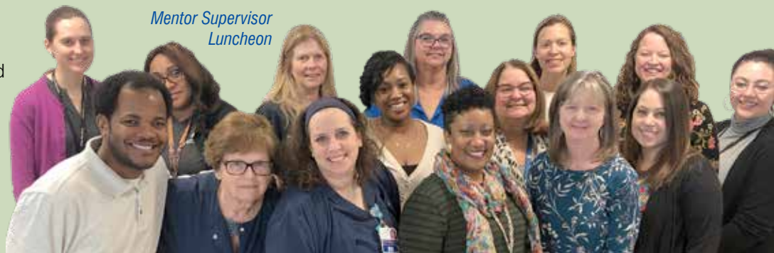
Mentor Supervisor Luncheon

The final internship experience has begun and many interns are assigned to two departments at the Institute, having the opportunity to continue building their skill set. The Project SEARCH team, mentors, and supervisors recently came together to collaborate about their experiences and challenges of the first year of Project SEARCH, and prepare for the 2019-2020 intern cohort. Overall, mentors and supervisors stated that the first year of Project SEARCH was enriching, refreshing, rewarding, encouraging and successful! We thank the entire Project SEARCH team for helping to unlock the potential of each of our interns. If you are interested in hiring a Project SEARCH Intern or hosting a future intern, please contact the Project SEARCH team!