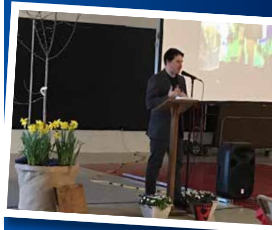
Jefferson Heritage Day