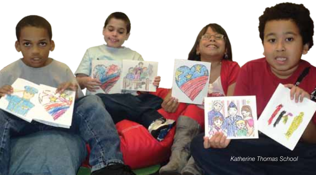
Katherine Thomas School