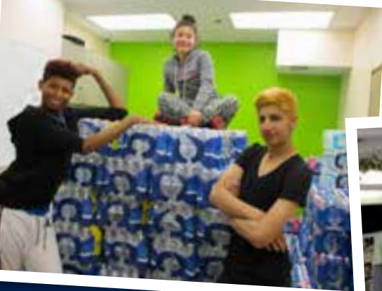
Ridge School Students