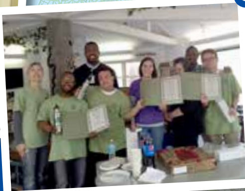
Ivymount post-high school students at Locust Grove Nature Center

certificate for their hard work and dedication, as well as a gift.