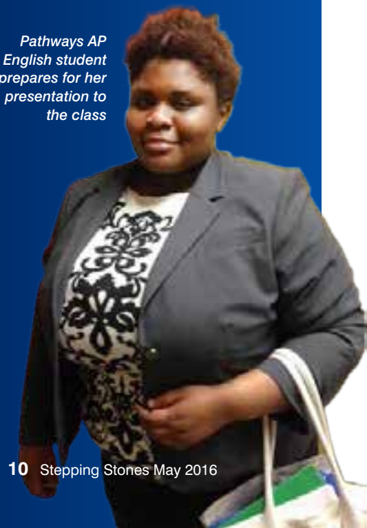
Pathways AP English student prepares for her presentation to the class

"It was important because nobody should have to fight for something that covers 75% of our earth. I helped because I care."