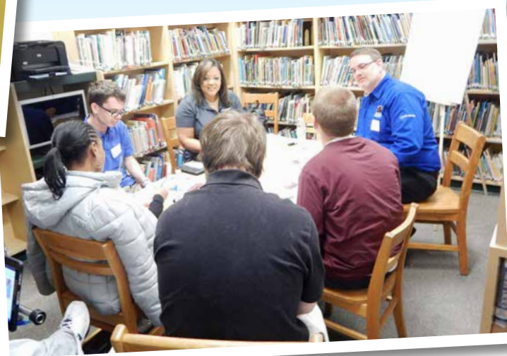
Ivymount students meet with business representatives at Mary Career Exploration Fair