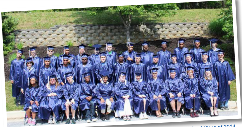
Harbour School Class of 2014

In June 2015, The Harbour School graduated its largest class ever. Eighty-seven percent of the graduates earned a high school diploma. Graduates were accepted to attend Prince Georges Community College, Anne Arundel County Community College, Baltimore County Community College, St. Mary's College of Maryland and Montgomery College among other institutions of higher education.