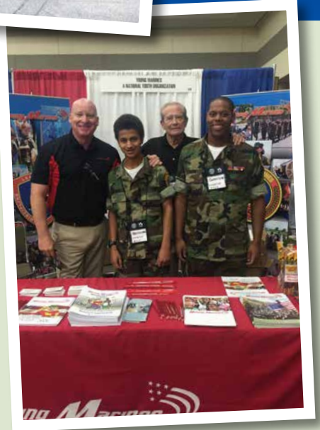
Kennedy Krieger Young Marines

Our Young Marine unit was one of only four units that assisted with the National Convention of the American Legion on August 31st at the Baltimore Convention center. The veterans were impressed with our Young Marines; several shook their hand and thanked them for their service! KKHS is the only Young Marines unit in the nation that is within a special education school. We are extremely proud of the students in our Young Marines program. The Young Marines program focuses on teaching the values of leadership, teamwork and self-discipline so its members can live and promote a healthy, drug-free lifestyle.