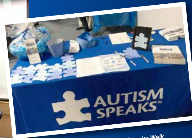
Dinner and kickoff for Autism Speaks Walk