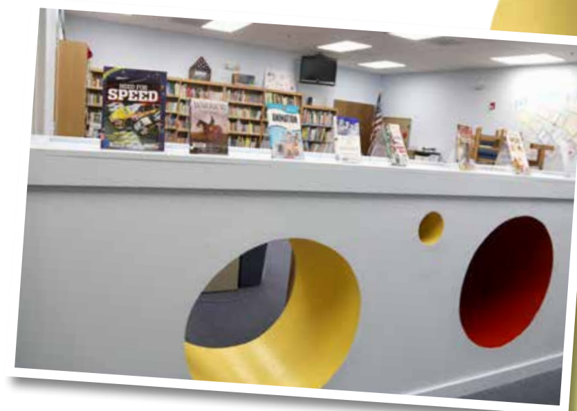
Media Center refurbishment and expansion includes new reading nooks

The Media Center at The Harbour School at Baltimore was expanded and refurbished over the summer break. It features a reading nook wall that allows readers to literally curl up with a good book.