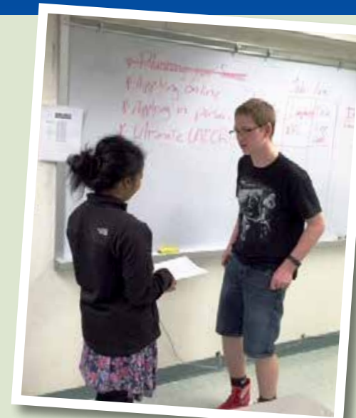
KTS students prepare for life after high school

This fall TLC's Katherine Thomas School and TLC's Outcomes Service began a joint workforce development program for high school juniors and seniors to prepare for work or post-secondary education. These 12 week sessions include career assessments, job preparation, social skills training, self-advocacy, basic literacy and computer skills, employer expectations, job searching, workplace readiness, transition services, and counseling on opportunities for in transition or post-secondary education. The program is held at KTS with field trips to employer sites and is DORS-funded for Maryland students.