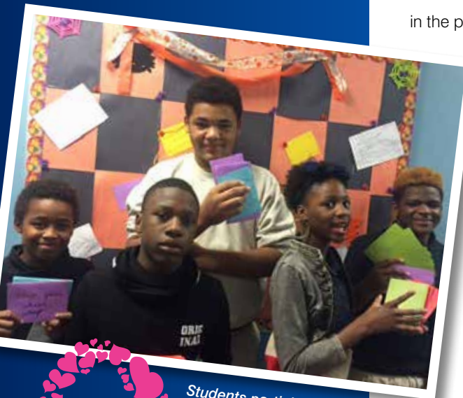
Students participate in the Girls Love Mail drive

Students at High Road School Prince George's county held their annual Girls Love Mail drive this October. October is Breast Cancer Awareness month and Girls Love Mail is a foundation that request letters to send to women and men who have just been diagnosed with breast cancer a letter of encouragement. This past summer Girls Love Mail ran out of letters to send to patients so our students set out with a goal of creating a 1,000 letters to mail in. Supporters can send letters year round. Visit http://www.girlslovemail.com/ for more information as the organization approaches its 90th birthday in November 2016.