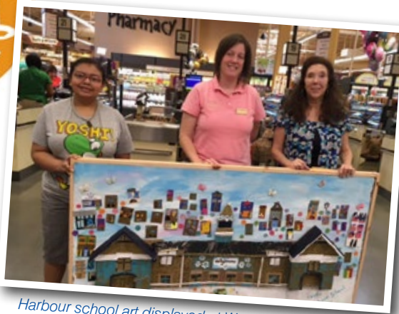
Harbour school art displayed at Wegmans in Owings Mills