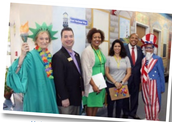
Harbour School Staff Celebrate Independence Day