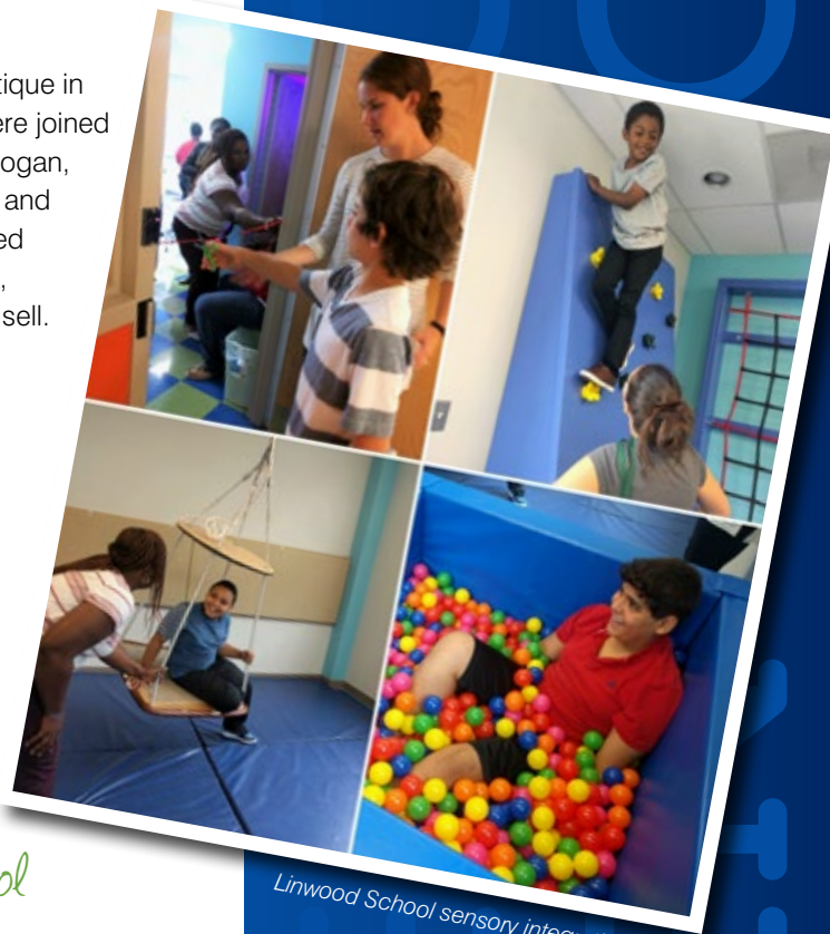
Linwood School sensory integration room

Linwood School kicked off the fall school term with the grand opening and ribbon cutting of their newly improved sensory integration room. Thanks to a generous grant from the John J. Leidy Foundation and contributions from individual donors, the school was able to revitalize their extensively used sensory integration room with brand new equipment. This equipment provides staff with a wider selection of tools to address students' sensory needs and enhance their occupational therapy services. The room now has two swings, a rock and rope wall, a ball pit, a peg board, bean bags, sensory lighting, a tactile board, and more. The students love it.