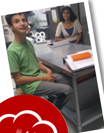
KTS Newly Renovated Kitchen

The Katherine Thomas School's Culinary and Restaurant Management students are enjoying their newly renovated commercial kitchen. The renovation included new commercial ranges, microwaves, and toaster, a griddle with a refrigerator underneath, and a 3 sink washing unit. The students will now be able to share the delicious fruits of their labors through sales to students and staff. The kitchen renovation was made possible through funds raised by the KTS Parents' Association at their annual auction.