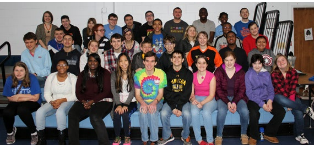
Lead to Feed team to be featured on Jumbotron at Ravens game

Over 200 excited attendants discussed best practices, exercised team building skills, explored academic innovations, and won fabulous prizes. We are looking forward to expanding next year's conference and continuing to SPARK a flame of informed inquiry in the realm of special education.