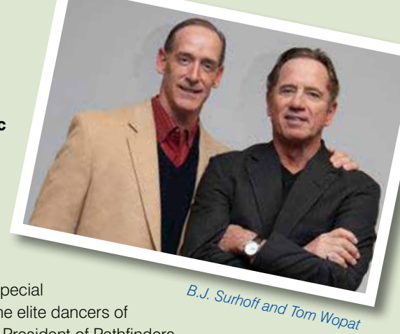
B.J. Surhoff and Tom Wopat

This benefit performance featured an entertaining mix of seasonal and Broadway favorites, performed by Wopat and an eight-piece band from New York. The magical night also included special appearances by the Friends School Chamber Choir , the Susquehanna Youth Ballet , and the elite dancers of the EMC Performance Arts Studio . A VIP reception hosted by Tom Wopat and B.J. Surhoff , President of Pathfinders for Autism and Orioles Hall of Famer, was held prior to the show.